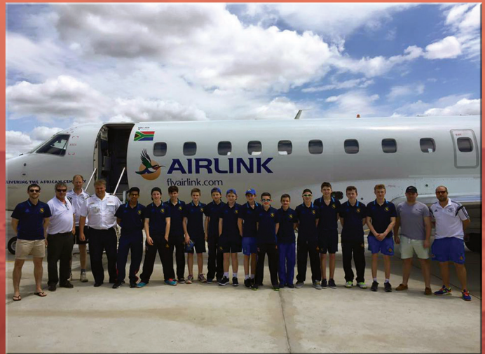
The 2016 Team