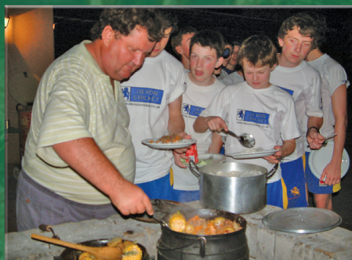
(left) Jannie's Potje - Well worth queuing for!