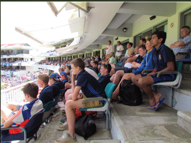
At Newlands to see South Africa v England 2016