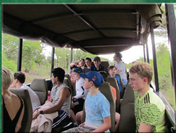
(left) Game drive in Kruger