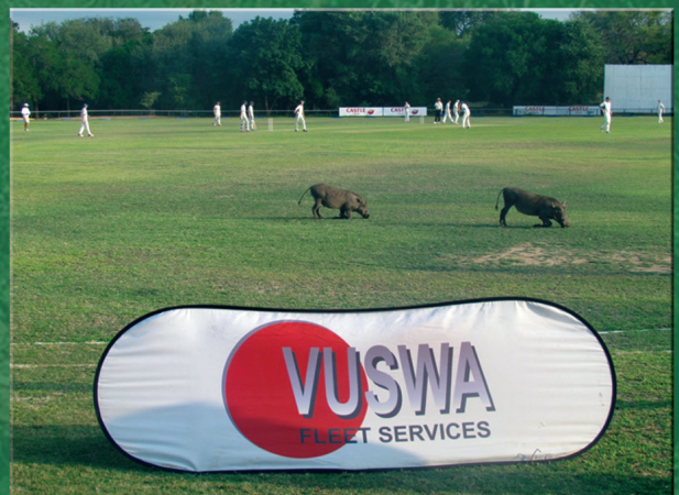
VUSWA have been generous sponsors for many tours