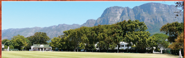
The Vineyard Oval Cricket Ground

We look forward to your sixteenth tour in 2017.