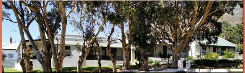
District 6 Guest House, Cape Town

Over the 15 years that your tour has graced our shores it has done so much to enrich the lives of many young cricketers. You must be delighted that several of the players who visited South Africa have graduated from the Devon youth development scheme to become successful first class players and indeed to represent England at international level. The tour may well have helped by providing an additional layer of experience.