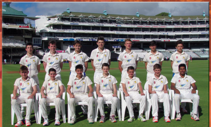
2016 Team at Newlands

THE DEVON DEVELOPMENT TOUR TO SOUTH AFRICA IN FEBRUARY 2017