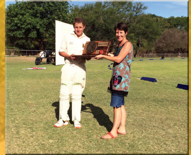
Presentation of the Battle of Kruger Trophy