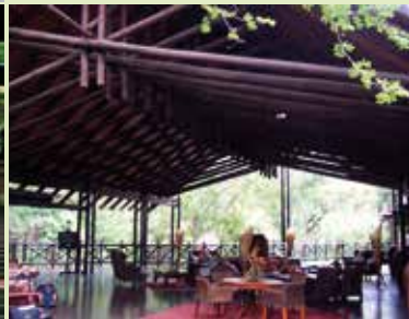
Hotel pool provides a welcome relaxation