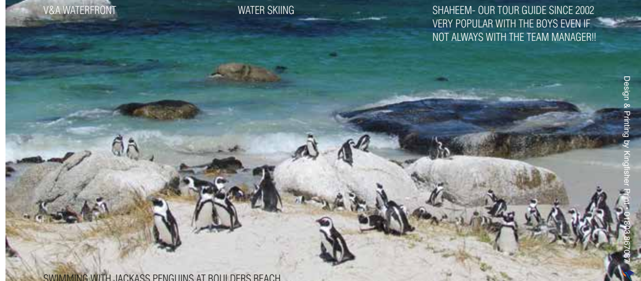
SWIMMING WITH JACKASS PENGUINS AT BOULDERS BEACH