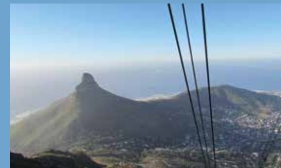
LIONS HEAD & ROBBEN ISLAND FROM TABLE MOUNTAIN CABLE WAY