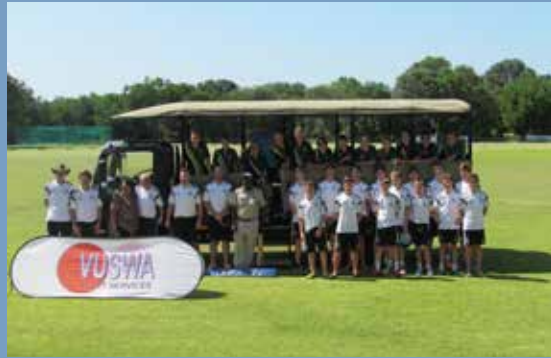
VUSWA - AN EXCELLENT TRANSPORT COMPANY IN KRUGER WHO HAVE DONE SO MUCH TO MAKE THE TOUR SO ENJOYABLE.