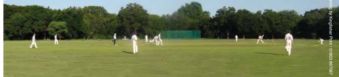
Skukuza Cricket Club