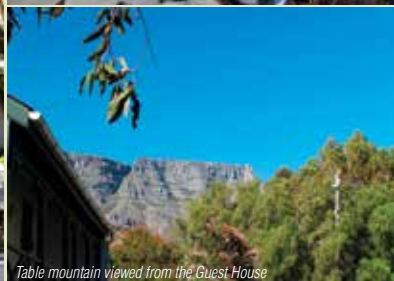
Table Mountain viewed from the Guest House