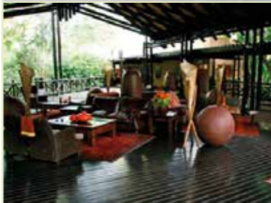
Lunch in the wild