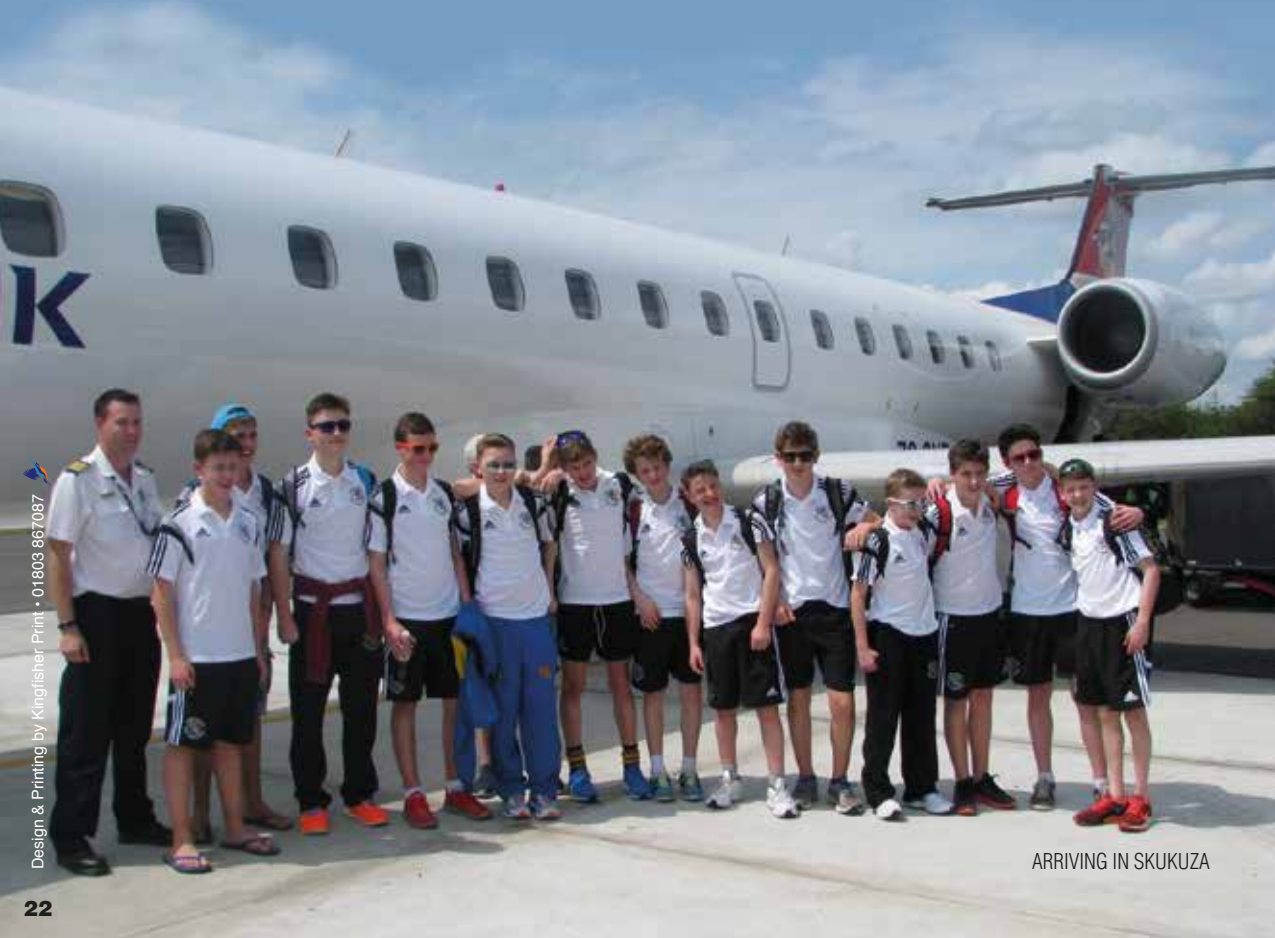
ARRIVING IN SKUKUZA