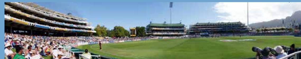
NEWLANDS CRICKET GROUND