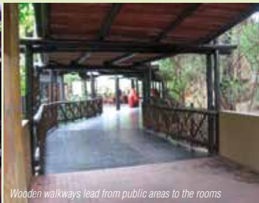
Wooden walkways lead from public areas to the rooms